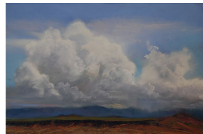
"Cloudstory #5" Plein Air Pastel Santo Domingo Pueblo