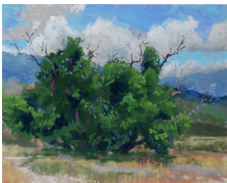
"Old Monastery Tree" Plein Air Pastel Pecos, NM

She was the 2007 Treasurer and the Program Chair of the Pastel Society of New Mexico for five years, and she is presently a signature member of Chicago Pastel Painters, Pastel Society of New Mexico, and Plein Air Painters of New Mexico, and member of Plein Air Artists Colorado, Pastel Society of Colorado, and AIS.